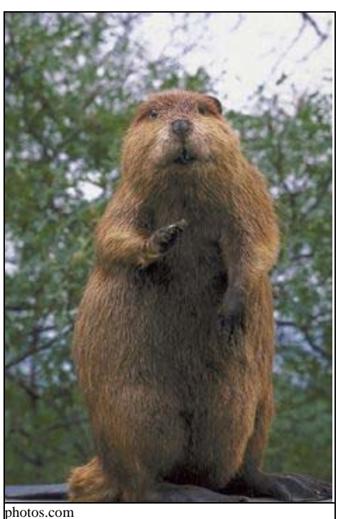
Gnawing on wood helps keep a beaver's teeth trimmed.

Like people, animals have different teeth with special jobs. Some animals have sharp teeth, some have curved teeth, and some have round teeth. Open wide, and look inside to learn about different ways teeth are helpful.